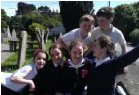
Junior Choir Members