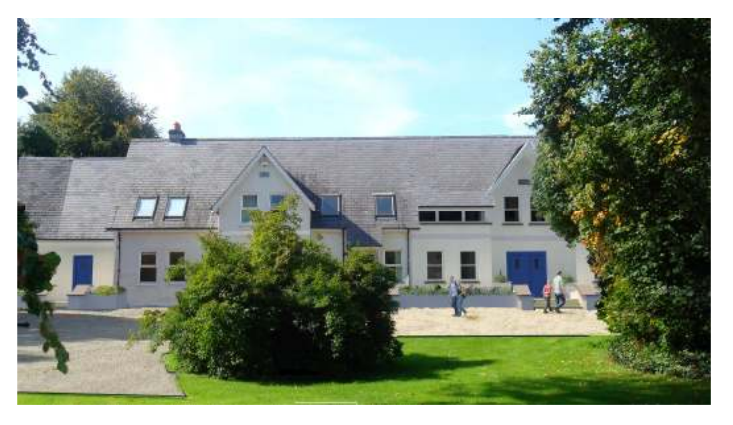
Parish of Newcastle & Newtownmountkennedy Parish Centre