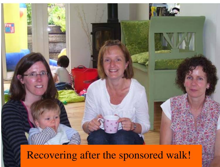
Recovering after the sponsored walk!