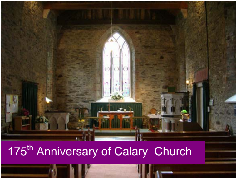
175 th Anniversary of Calary Church