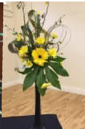
Autumn Glory! A few of Sheila's Masterpieces