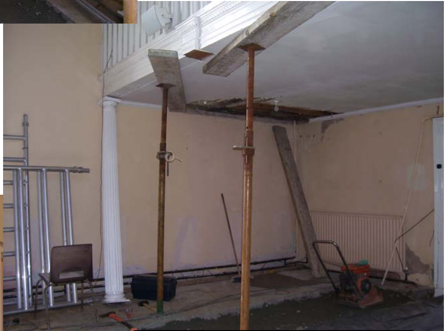
Newcastle Church April 2010