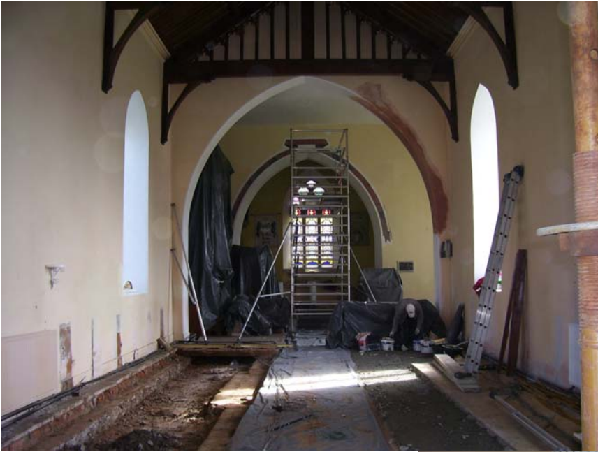
Newcastle Church April 2010