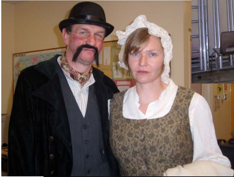
Actors and scenes from “The Ghosts of Marvin Grange”