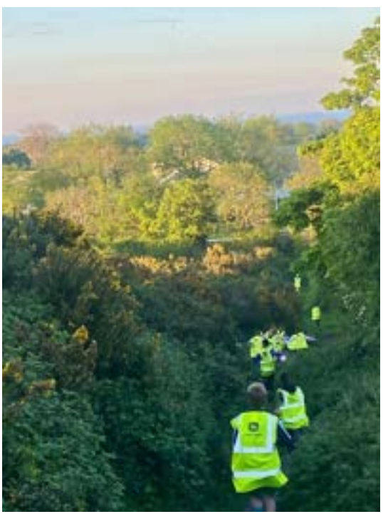
Junior Youth Group enjoying the Heritage Walk!