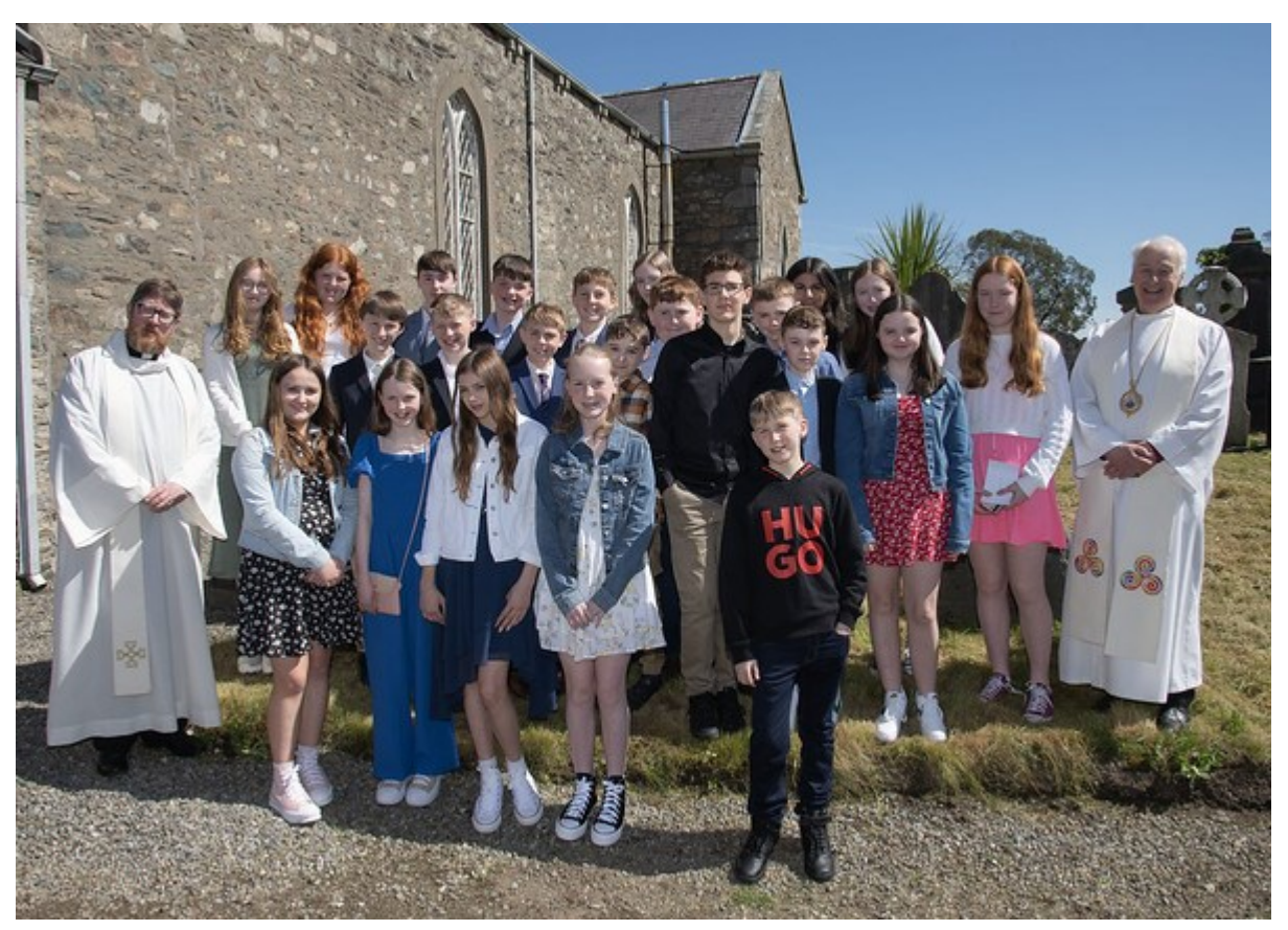
Confirmation in Newcastle