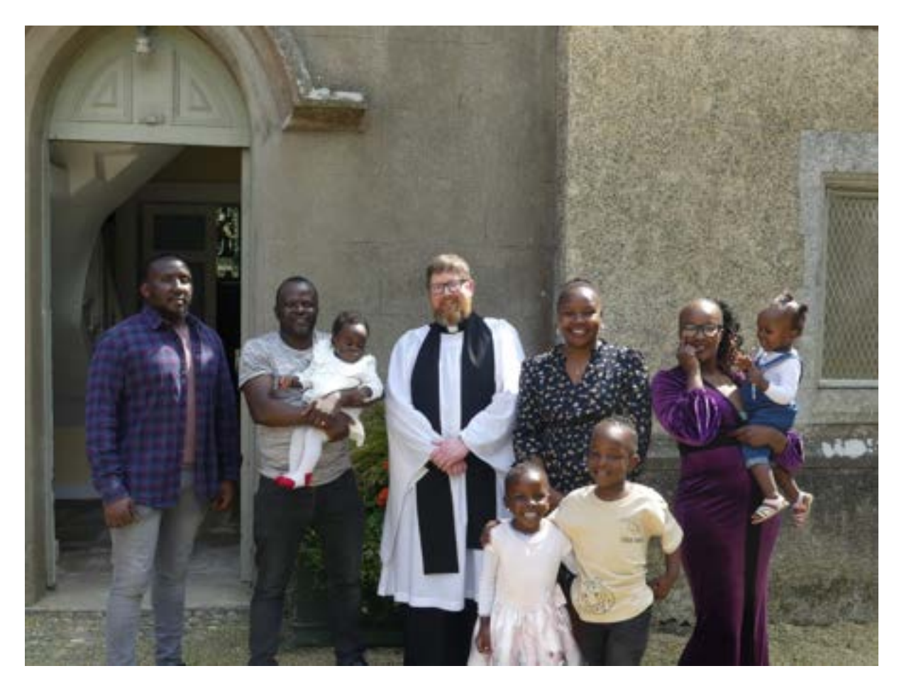
Baptism in St Matthew's