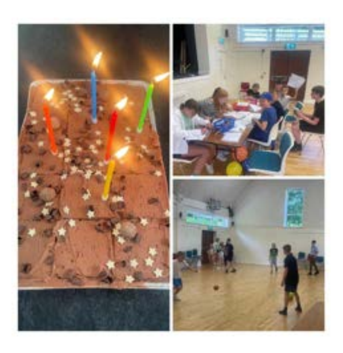
Sunday Club celebrating Pentecost!