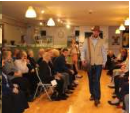
The Male Models