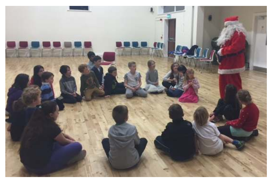
A visit from Santa