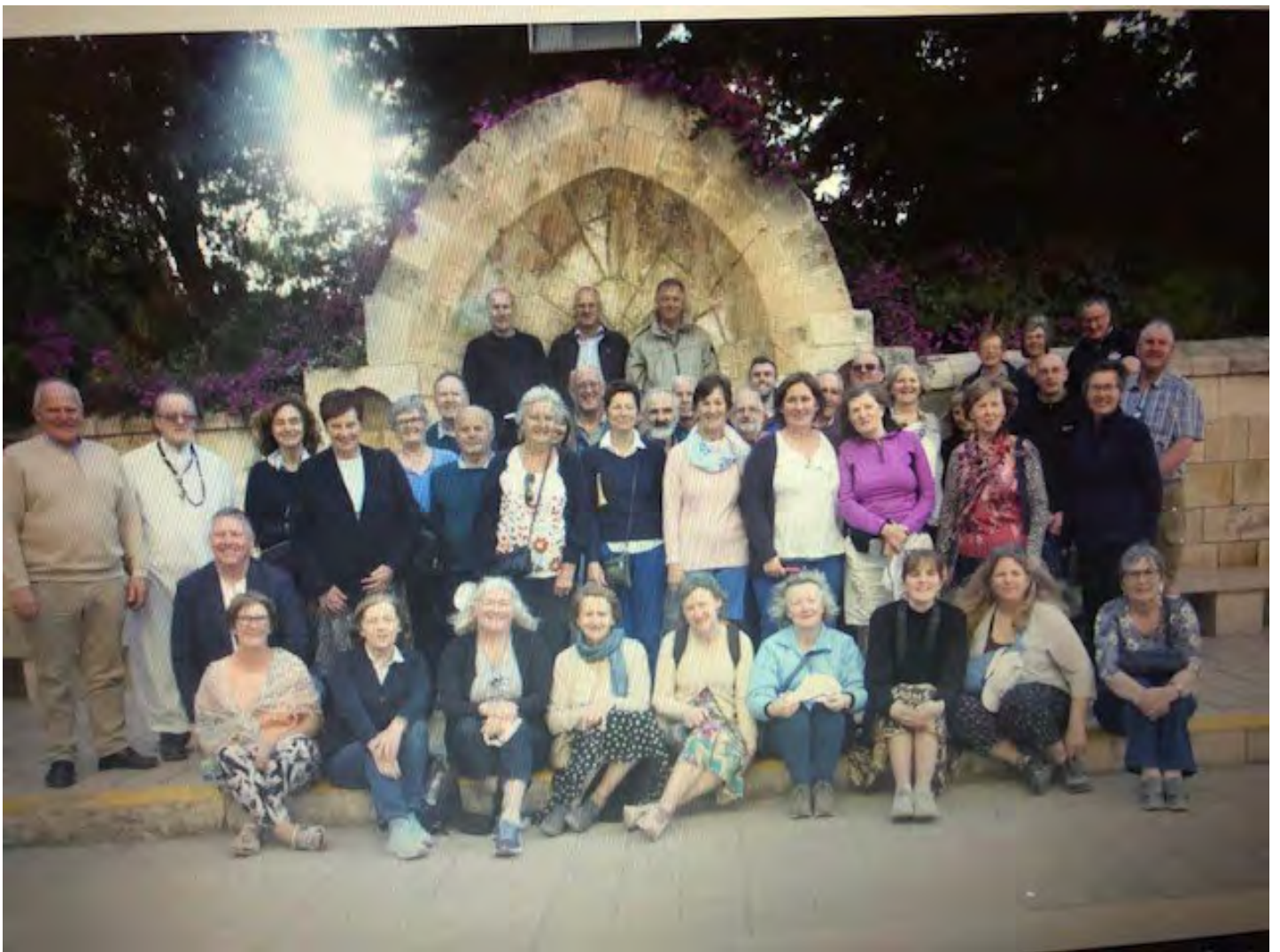
Some of the group who travelled to Jordan and Israel November 2019