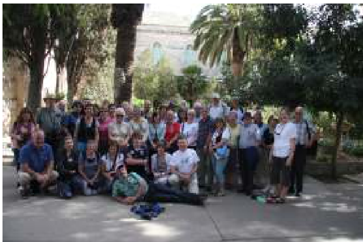
Israel Trip November 2011