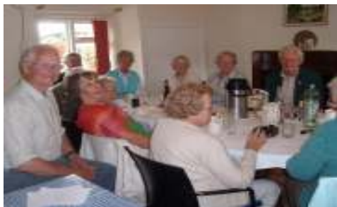
Happy diners at July's Thursday Lunch